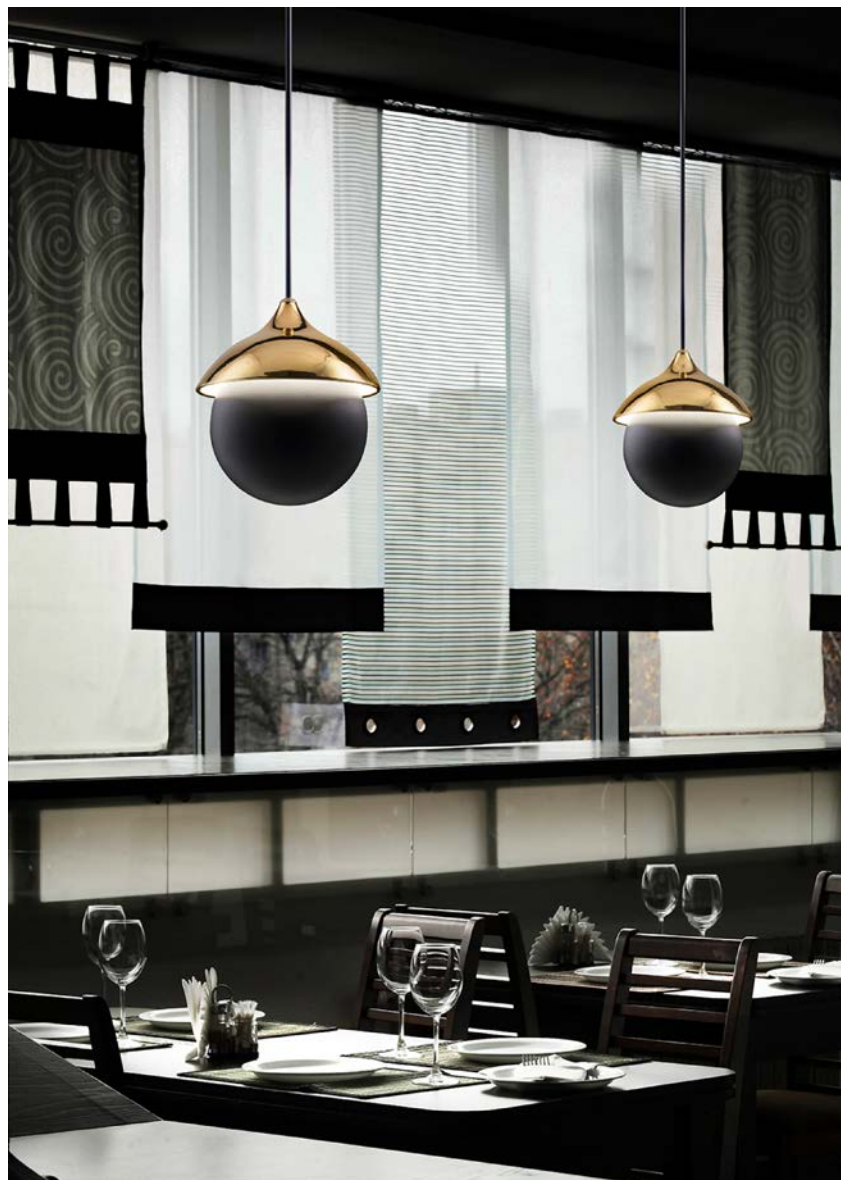
2) Art. L9/NM/AU